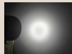
Other Exam Lights